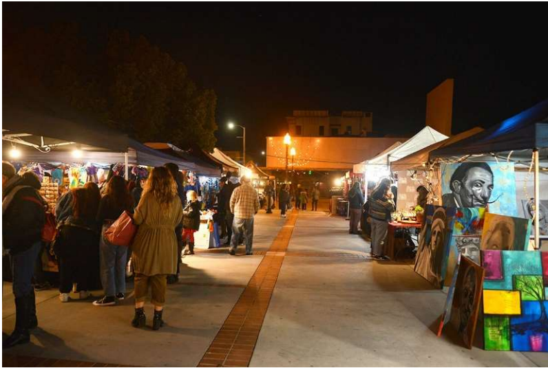
City of Pomona Night Market/Art Walk