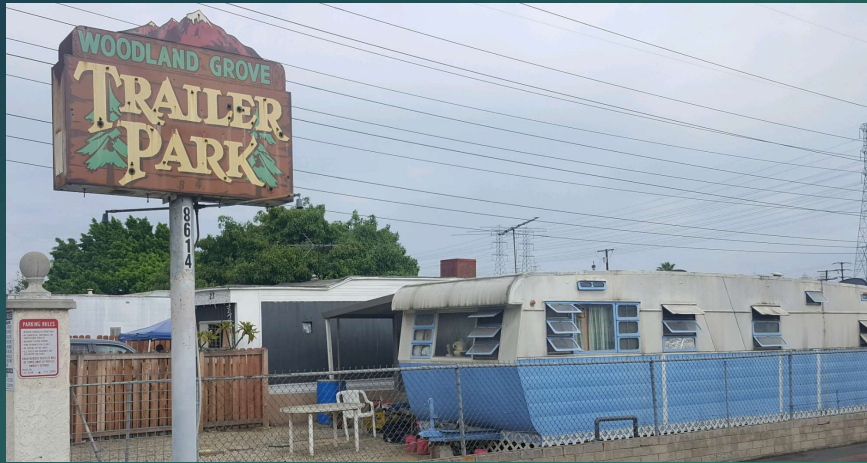
Woodland Grove Trailer Park 8614 Flower Ave.