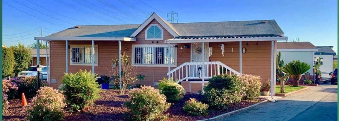
The Californian Estates 7101 Rosecrans Ave.

Note: Examples shown only to demonstrate eligible type. Households would have to meet all other eligibility requirements.