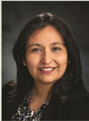
ISABEL AGUAYO Vice Mayor