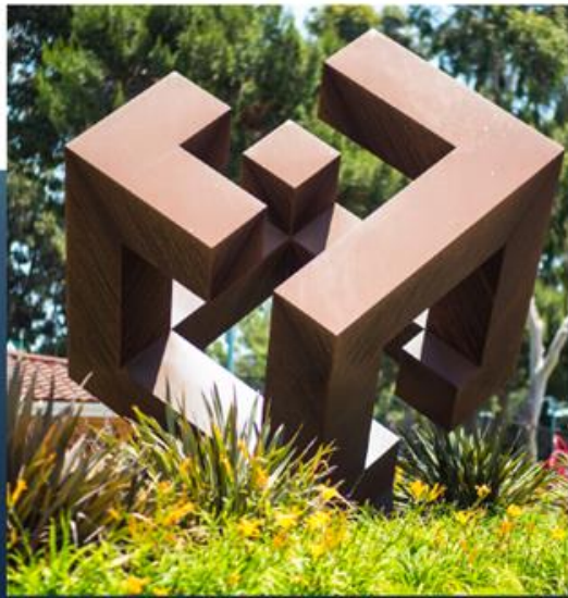
City of Paramount - Impact of Default Change